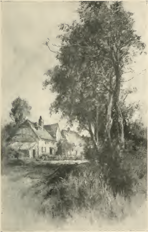
Far from the madding crowd's ignoble strife